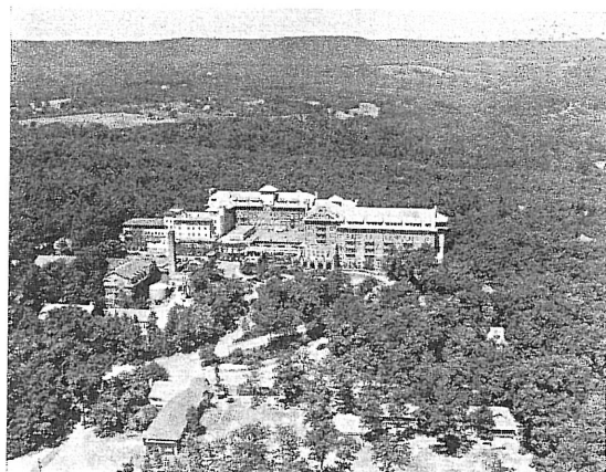
AERIAL VIEW OF THE INN IN ITS SETTING IN THE POCONO MOUNTAINS IN EASTERN PENNSYLVANIA